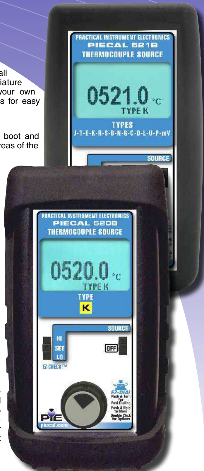
Actual Size (Shown with optional boot)

* PIECAL Calibrators are not manufactured or distributed by Fluke Corp or Altek Industries Inc, manufacturers of Altek Calibrators.