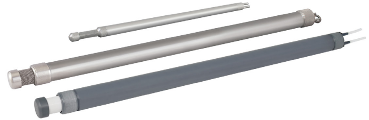
1.66" (42 mm) and 5/8" (16 mm) dia. Stainless Steel and 1.66" dia. PVC Double Valve Pumps

The DVP is suitable for low flow or regular flow sampling. Stainless steel pumps can operate to depths of 150 m (500 ft) and the new PVC DVP can operate to depths of 30 m (100 ft).