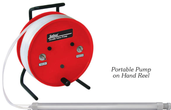
Portable Pump on Hand Reel

For less frequent sampling, reel mounted portable systems allow access to multiple monitoring wells, even in remote locations. The reel mounted portable units are free-standing with a convenient carrying handle. They can be made for almost any size or depth of application.