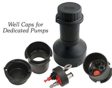
Well Caps for Dedicated Pumps