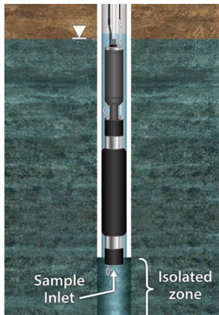
A Model 800M Packer can be used to isolate the sampling zone and reduce purge volumes.

Tag Line: Convenient reel-mounted marked cable, for measured depth deployments. (See Solinst Model 103 Data Sheet).