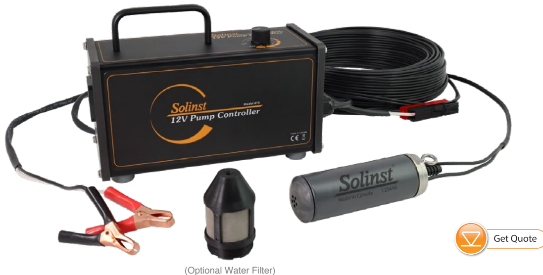
(Optional Water Filter)