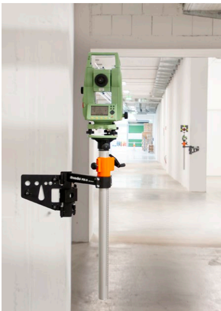
Attachment to a wall with screws