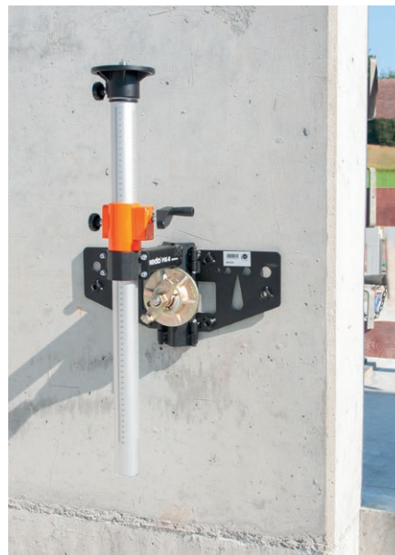
Attachment to a wall with a tie rod