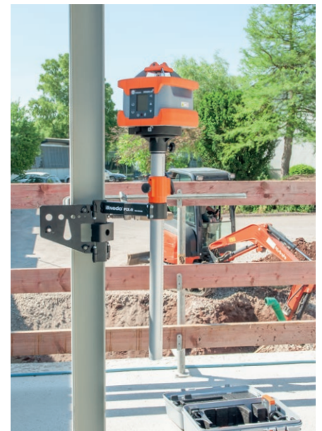
Attachment to a steel beam with a screw clamp