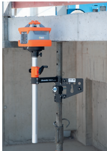
Fix-it attached to a support