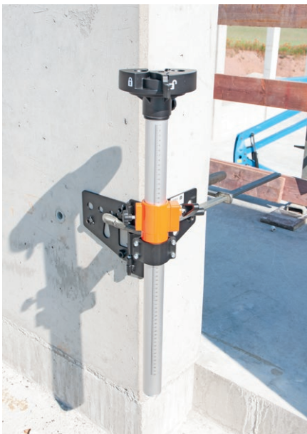
Attachment to a concrete pillar with a screw clamp