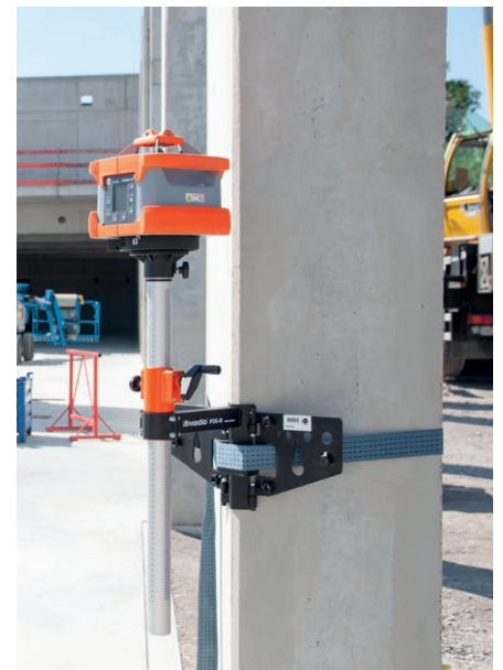
Attachment to a concrete pillar with a tension strap