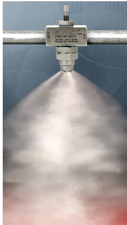
Produce a large volume, fine mist or a hard hitting spray with these adjustable liquid nozzles.

Model: AW5030SS Material: Type 303 Stainless Steel