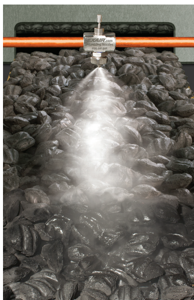
A Model AW1030SS is used to keep dust down during charcoal briquette production.

For pressure fed applications not requiring independent air and liquid control.