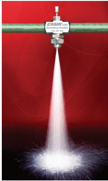
The amount of liquid applied can be greatly varied by adjusting the valve or inlet pressures.

For pressure fed applications not requiring independent air and liquid control.