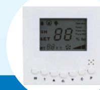
Optional Remote Control