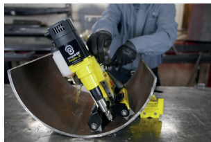
Swivel base can be used on flat as well as curved surfaces.