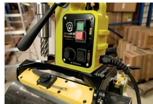
High performance 2 speed gear box.