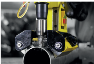
Lightweight, compact and safe magnetic drill.